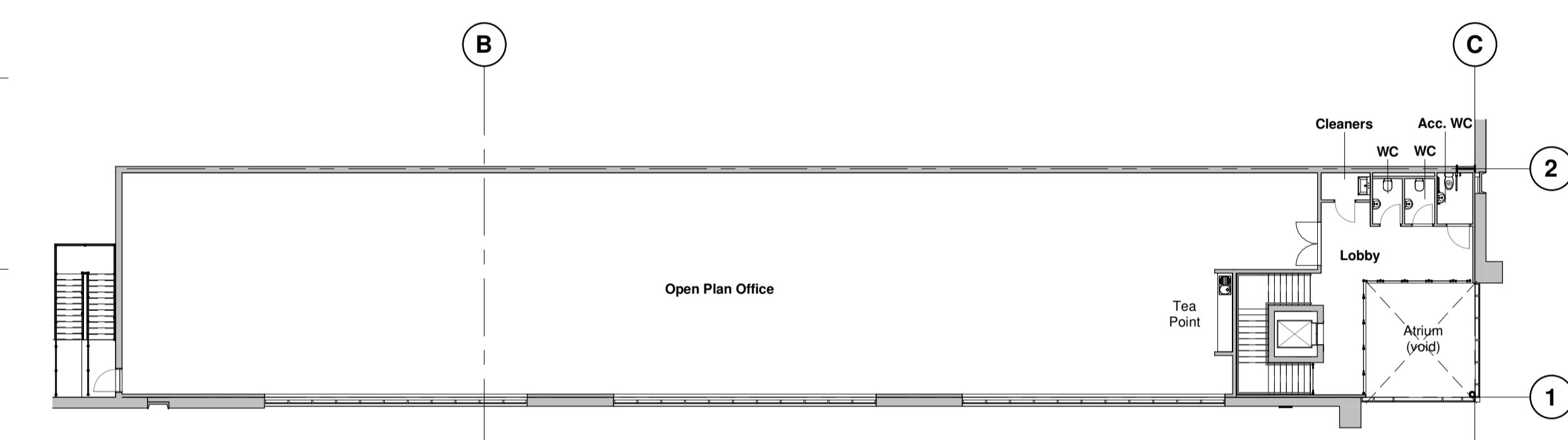
20-02 Proposed Second Floor Plan 1:200