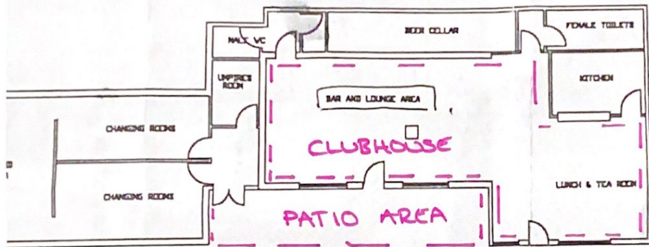
GROUND FLOOR PLAN AS EXISTING