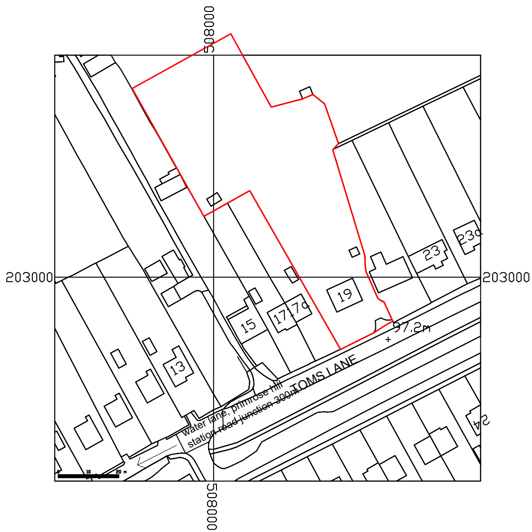
LOCATION PLAN (1:1250 @ A3)

A. 01/04/2020 Boundary confirmed Rev. Date Amendment