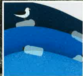
More On Marine Litter