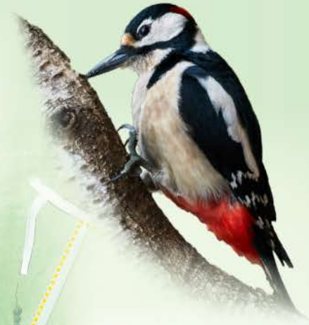
Great spotted woodpecker

You can see a wide variety of plants and animals as you explore the wood. These might include flowers like common spotted orchid and enchanter's nightshade, butterflies such as white admiral and silver-washed fritillary and birds including woodcock, nuthatch and great spotted woodpecker.