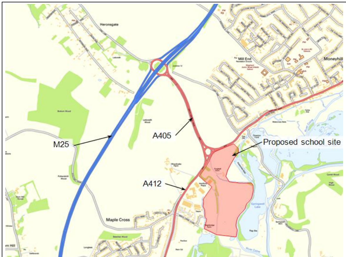
Figure 1.1 Site location